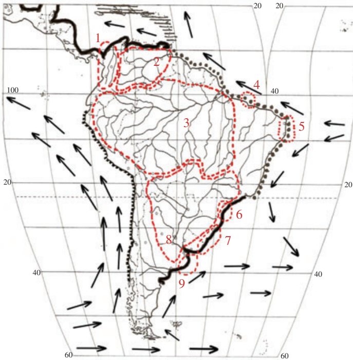
FIG. 1. South American river basins and coastal areas discussed in the present work: (1) Magdalena Basin, (2) Orinoco Basin, (3) Amazon Basin, (4) Caeté River and mangrove coastline, (5) Goiana Estuary and tropical semi-arid eastern coast, (6) Paranaguá Estuary, (7) Patos Lagoon estuary, (8) Paraná–La Plata basin and estuary and (9) south-west Atlantic coastal shelf (SWACS). Main ocean currents are also indicated (source: modified from Briggs, 1996).

to other countries. According to these authors, the decimation of aquatic wildlife through overexploitation is usually perceived as a marine phenomenon, yet it has been common in freshwater ecosystems.